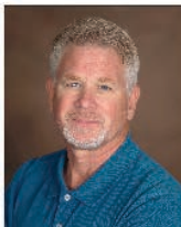
Member, F.S.O.S. Belmar