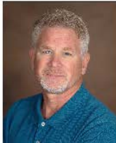
Member, F.S.O.S. Belmar